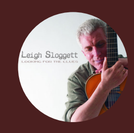
Looking for the Clues